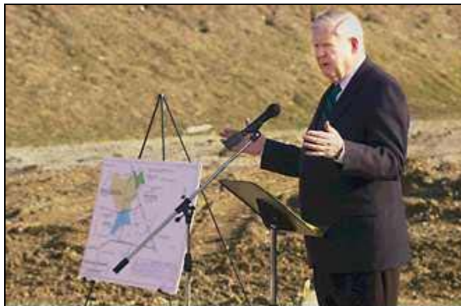
U.S. Rep. John Murtha addresses a crowd Saturday at the Fayette County Business Park in South Union Township. Murtha held a press conference to announce his procurement of more than $1 million to further develop the business park.

U.S. Rep. John Murtha (D-Johnstown) announced his procurement of more than $1 million to further develop the Fayette County Business Park in an on-site press conference Saturday.