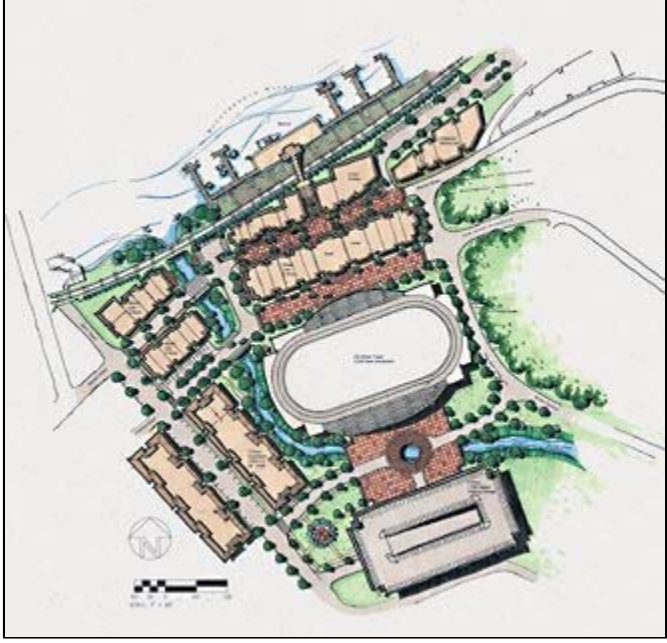
The drawing above shows a proposed velodrome or Olympic-style cycling arena that is being proposed for downtown Brownsville.

"This is a $123 million project," Koffler said. "They need to